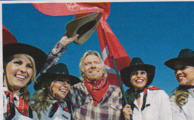
Having a Blast-Off Branson at a party for Virgin America in Dallas p64